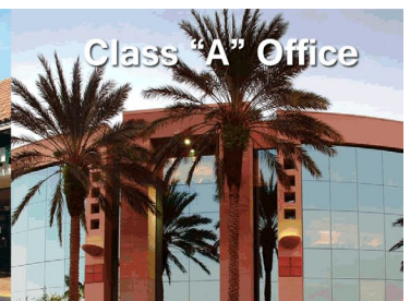
Class "A" Office